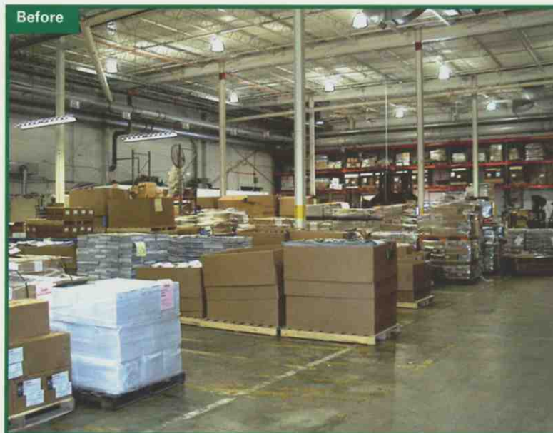
Floor space is at a premium when stock is spread out.

From design to delivery, we engineer each mezzanine we sell. We start on paper with a design you approve before proceeding to the next stage of production, for a true "what you see is what you get" preview of the product. All our mezzanines are manufactured on our premises with quality control our first priority. So whether you need us to work with your professionals or use ours for the full Cogan turnkey service, you benefit from our innovation, quality and experience that has kept Cogan on the leading edge since 1901.