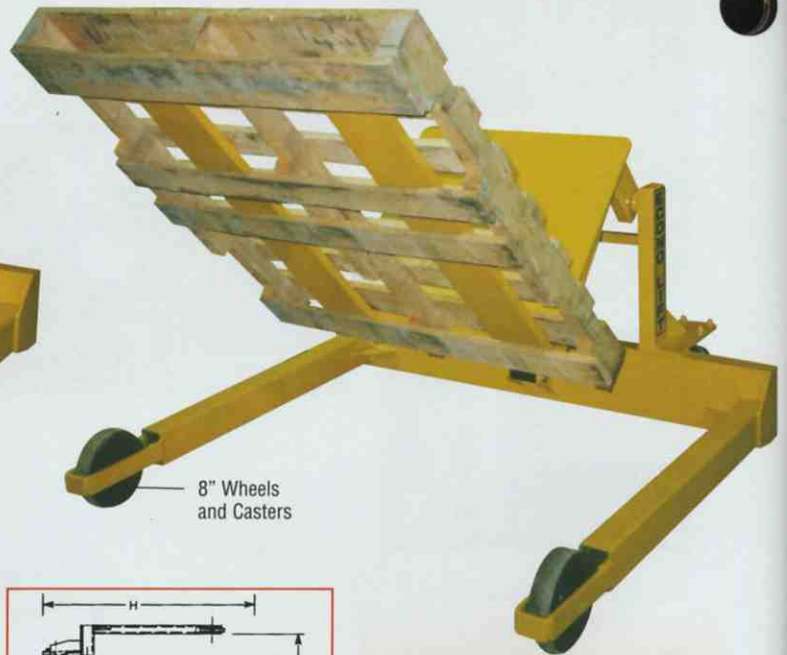
8" Wheels and Casters