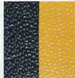
Black with Yellow Pebble Surface