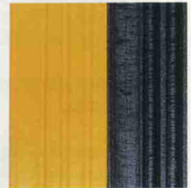
Black with Yellow Rib Surface