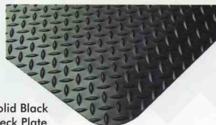
Solid Black Deck Plate