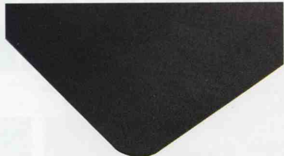
Black Textured Rubber