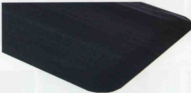
Black Corrugated Rubber