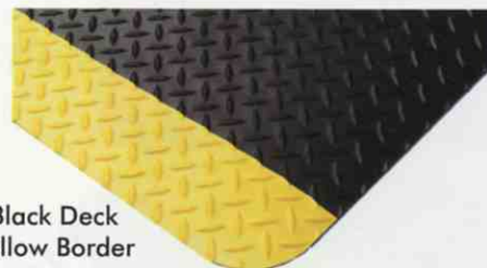
Black Deck Yellow Border