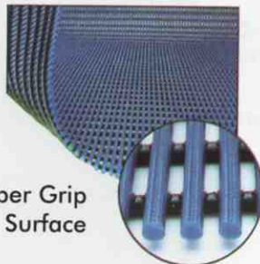
Super Grip Surface