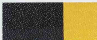
Black with Yellow Pebble Surface